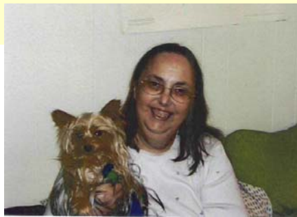
Miss Melody with Sweet William